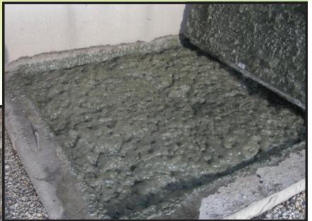
Foaming Manure Pit